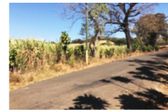
Frente de propiedad